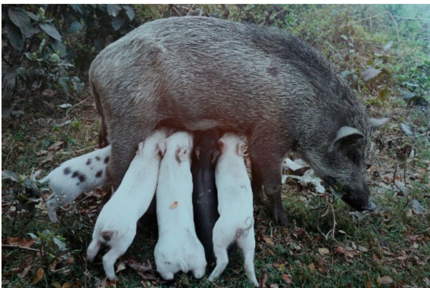
Pong, Juergen Teller: WILDSCHWEINMUTTER 2014 KALKUTTA PING PONG

Fuentes adds, "Also, sometimes we just wanted to see the answer." Photographers sent old works and